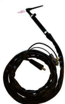
Tig Torch (AWP26V)